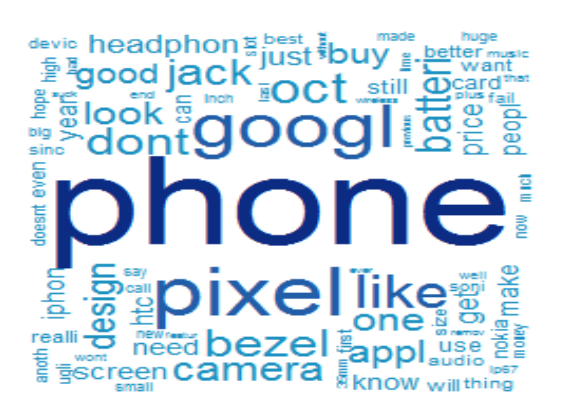
Figure 3: Word Cloud of Customer Reviews for Google Pixel 2

On analyzing the word cloud for Customer Review for Google Pixel 2 as shown Figure 3 reflects that most talked terms amongst people are battery, high hope, card slot, price, doesn't even, screen etc.